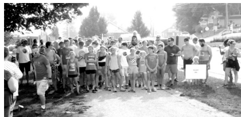
July 4 th Family Fun Run