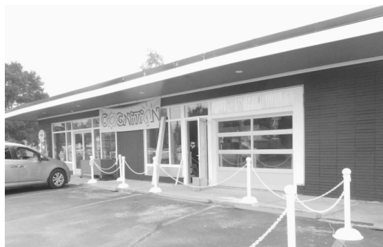
Cognition Science & Discovery Center, before and after their exterior window upgrades. Thanks to the Grand Traverse Band 2% Grant, Art & Mary Schmukal Foundation and Anne Damn Memorial Gift.