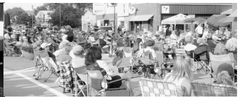
Crowds are wowed by the music!