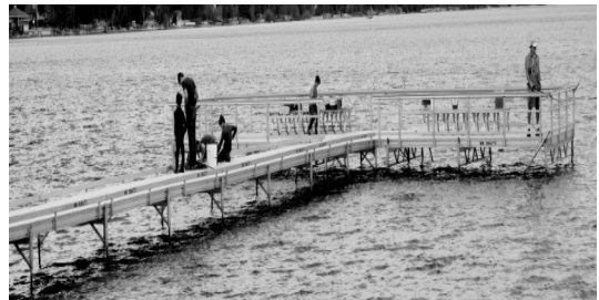
Fishing started very quickly.