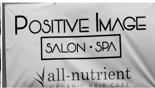
Welcome to McKenzie and Positive Image