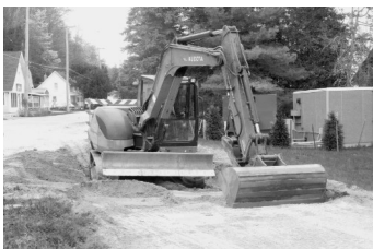
AJ Excavating working on the trail.