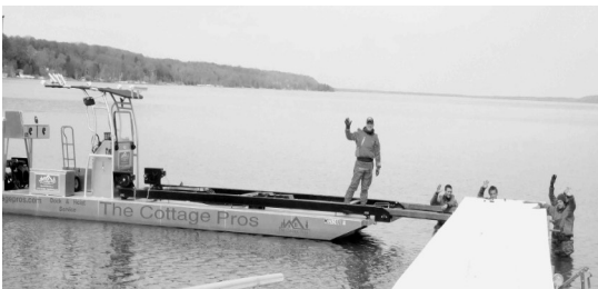
Cottage Pros install the Fishing/T Dock.