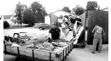
Trash collection day in Beulah

*Darcy Library has an ongoing book sale inside the library. Donations of new or gently used hardbound and softbound books are appreciated.