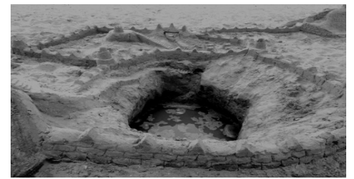
Sand Castle on Beulah Beach

Ways to control Invasive Eurasian Watermilfoil were researched by the Crystal Lake & Watershed Association (CLWA) over a period of several years. This invasive species quickly developed a heavy breeding ground along the southeast and eastern shoreline of Crystal Lake. Eradicating this nature-offensive genus will be of consequential importance to Beulah residents, because the heaviest concentrations of the invasive species are located by Beulah Public Beach and Boat Ramp. Several years of exhaustive research and work by CLWA led to a public information campaign to provide and continue to public outreach and education. A huge private fundraising effort was undertaken to support the implementation of controlling this nuisance growth where it exists and is choking out Crystal Lake's flora and fauna. In a letter to the Village of Beulah, the CLWA Team wrote " the invasive EWM continues to be an aggressive and fast-spreading plant. New drone-based monitoring in late summer 2020 showed significant increase in the plant infestation at the east end of Crystal Lake since the original 2017 data. CLWA is grateful for the cooperation and support of the Village and residents as we work together to preserve Crystal Lake for generations to come. " A special team led by drone sightings dropped pellets into the infested areas along the shoreline on June 29, 2021. It should be noted that both CLPRA and the Village of Beulah worked with CLWA to foster this important environmental effort.