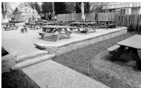
New hard-scape at Five Shores