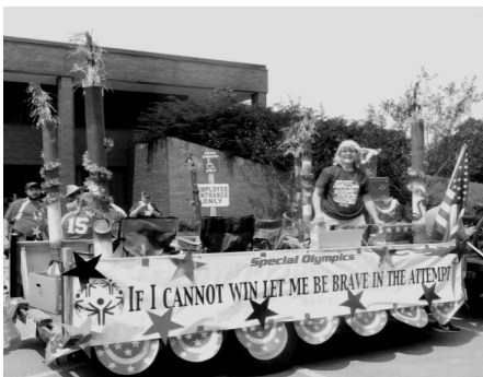
The Special Olympians' float recognized their athletes.