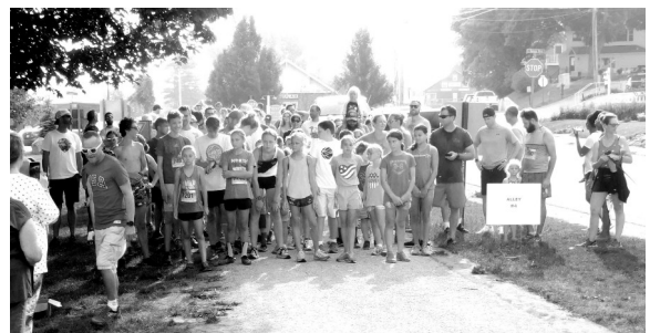
The Family Mile Fun Run had eager runners!