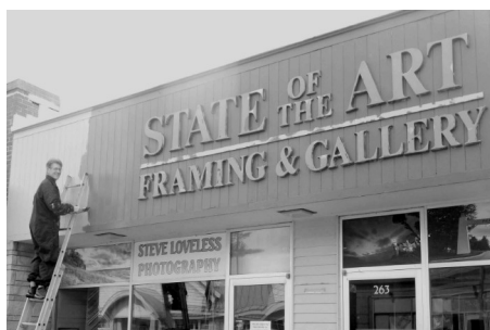
Upgrades at State of the Art