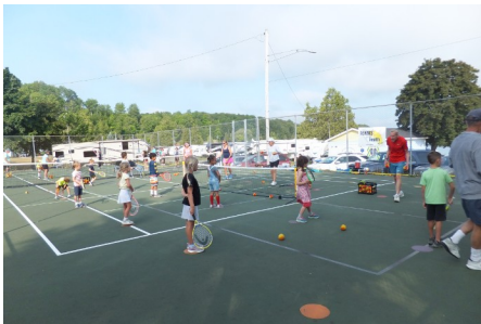
(left) free adult and youth lessons on Village tennis court.

Questions may be sent to: mybeulahboosters.org or call 231-383-1120 and leave a message