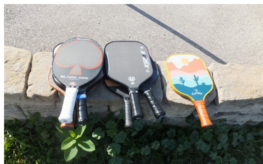
center: pickleball paddles lined up to play