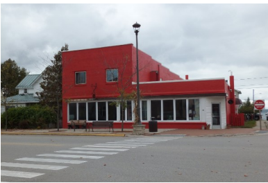
Fresh paint brightens the corner.