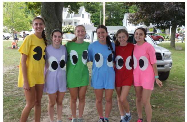
Girls just wanna run (and have fun) was evident with this team of runners in the Crystal Lake Team Marathon.

The Accidentals will return to Music in the Street on July 18, 2024!