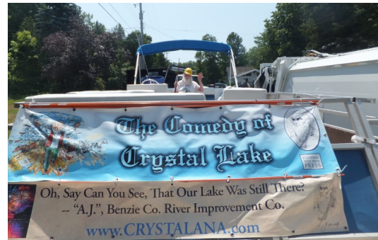
'Archibald Jones' celebrated 150 th Anniversary of the lowering of Crystal Lake in the July 4 th Parade.