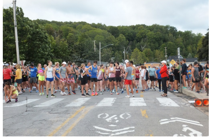
First leg runners in the Crystal Lake Team Marathon. 74 teams from around Michigan were entered.