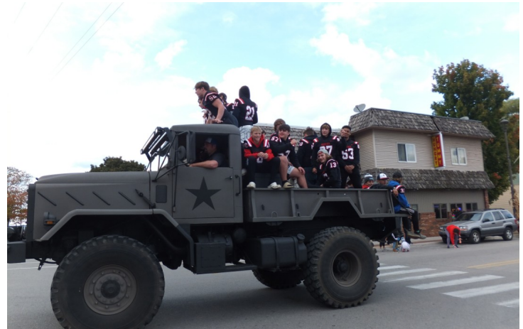
Homecoming parades also need a truck load of football players, cheered by the crowd!

Congrats to the Huskies for a Homecoming Win!