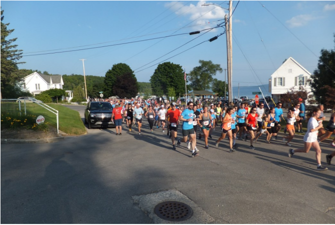
A running start for the 500+ runners in the 4 th of July 5K race and many spectators cheered their favorites.

“Shall the limitation on the amount of taxes which may be imposed on taxable property in the Village of Beulah be increased by 4.6136 mills ($4.61 per thousand dollars of taxable value) for a period of thirty (30) years, from 2024 through 2053, as new additional millage in excess of the limitation imposed by the Michigan Compiled Laws section 211.34d, to restore Village Charter Millage authorization previously approved by the electors as reduced by operation of the Head lee amendment, to provide funds for the general operating purposes? It is estimated that 4.6136 mills would raise approximately $202,000 when first levied in 2024.”