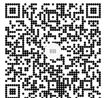
donation go to the Beulah Boosters/BB