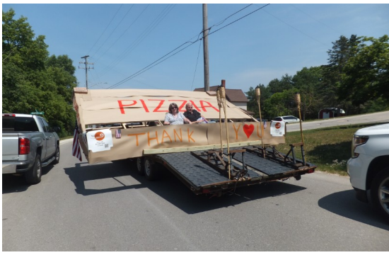
The Hungry Tummy's pizza box float took first place in the 4 th of July Parade, celebrating 50 years in Beulah.