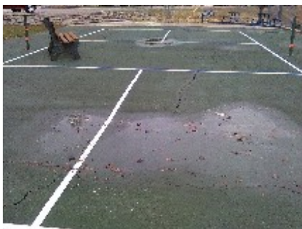
left: uneven surface collects water