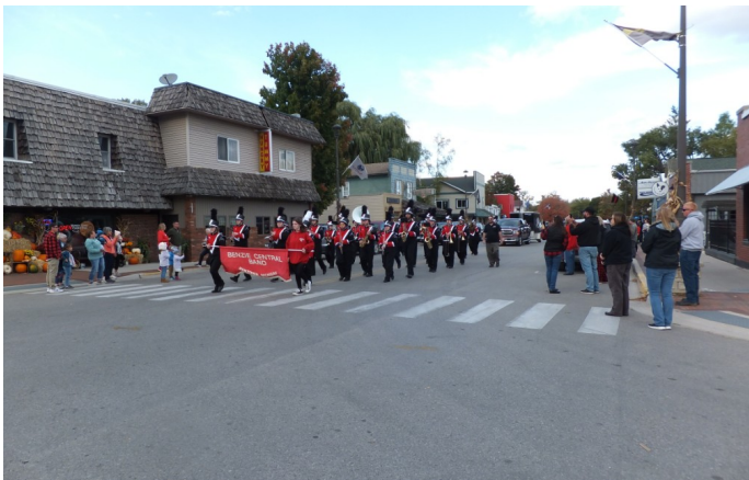
Benzie Central’s Homecoming Parade wouldn’t be complete without their marching band in uniforms and precision.

Congrats to the Huskies for a Homecoming Win!