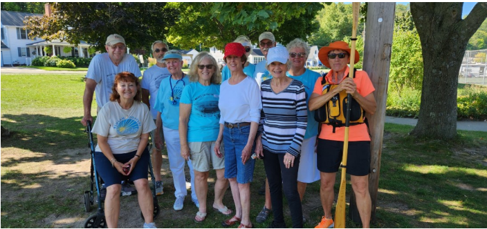
Beulah Boosters enjoy another successful bridge walk.

The Booster's goal is to support local groups by providing volunteers and financial resources in order to build cohesiveness in the community and to promote Beulah as a vacation destination. Members of this non-profit are asked to volunteer on at least one community activity each year. Come and have fun, everyone is welcome! For more information or to volunteer, please check the website: mybeulahboosters.org to send an email or call 231-383-1120 and leave a message.