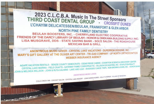
Music in the Street was well attended. Approximately 4400 gathered at the intersection of Benzie Blvd. for the seven concerts. Thanks to our sponsors and donors.