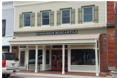
New name gets new sign for Evergreen Mercantile