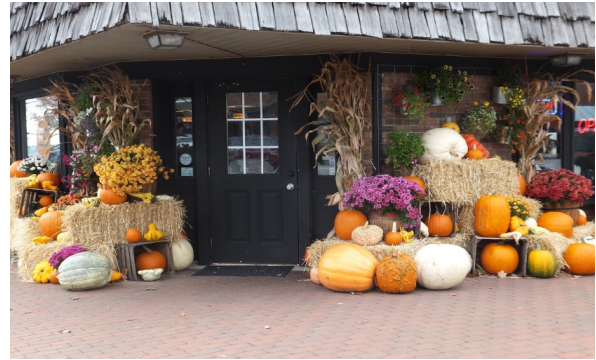
Many thanks to the Hungry Tummy for hosting the Fall Fest Soup contest when bad weather kept us from the pavilion