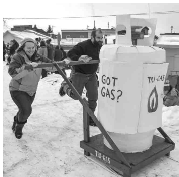
Tri State Gas entered their 'tank' outhouse at the 2020 Winter Fest outhouse race.

>Village has fax services and a paper shredder that are available free to residents and businesses during Village office hours (when they reopen).