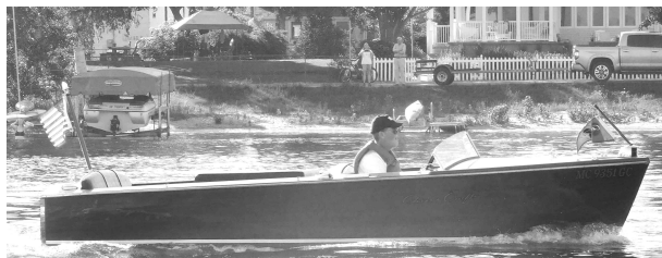
One of the classic boats in the July 4 th lake parade.

July 4 th : The Classic Boat Parade expanded to include over 40 more 'regular' watercraft around Crystal Lake, led by the Sheriff's patrol boat.