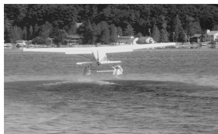
Another summer visitor to Crystal Lake.

The Village Newsletter and Village Council minutes can be found on the website: villageofbeulah.net