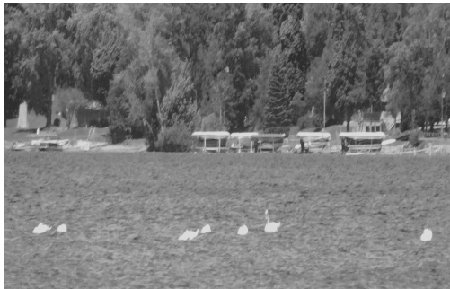
A bevy of swans enjoy Crystal Lake.

From the President: In our last newsletter, we noted Beulah had been eerily quiet since February with little car or foot traffic, as well as almost no sign of people downtown except to pick up their mail at the U.S. Post Office. By late June and the July Fourth Weekend it was as though a switch had been turned to bring the Village back to its busy summer self. Kids filled the Crystal Lake Playground, the air at Beulah Beach held the scent of sunscreen, and squeals of laughter rose as kids plunged into the chilly waters of the lake – great pictures of summer and music to the ears. Benzie Boulevard is now packed – bumper to bumper - cars parked along both sides of the street, as well as on each of the cross streets and in the village parking lots.