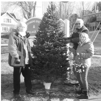
Boosters help decorate trees in Beulah.

The light and music show at the Lucky Dog & Grille was another chance to help make Beulah a special place.