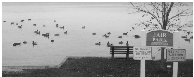
Our waterbirds enjoy Crystal Lake too. The swans with their young cygnets and geese gather.

From the Village President: Anyone passing through Downtown Beulah in the Five Corners area during the two-week period after Christmas could not help but assume the recently completed Beulah Water Project was back under way. The night of Christmas Eve the Village Crew responded to a report of a significant leak at the lower end of Spring Valley Drive. It is not unusual to see water coming from the ground along Spring Valley, because many underground springs run adjacent to and underneath it. However, a test of the water revealed that it was coming from the village water system. For the next ten days, attempts to locate the source were unsuccessful until the Village Crew examined a seventy-year-old map. The presence of an old 2-inch water main was discovered, along with the identification of a partially abandoned, open valve. Finally, the source of the leak was resolved. I want to thank residents who incurred shutoffs during this period for their patience. Also, special thanks to our Village Crew who worked long hours along with our excavating and engineering firms - under less-than-ideal conditions to correct the problem.